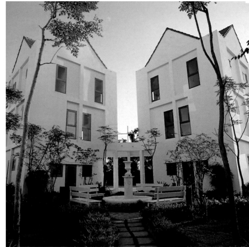
บ้านสองหลังที่เชื่อมกันด้วยระเบียง จะตั้งล้อมสวนเล็กๆ ตรงกลาง โดยหันหลังบ้านให้กัน บ้าน TARAS - DIAMOND CONCEPT

Please feel free to contact us at anytime to discuss any of the information provided in this expression of interest or to seek further information.